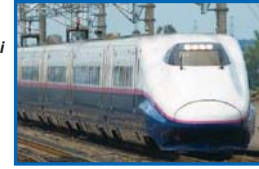
Tohoku Shinkansen "HAYATE"

Nagano Shinkansen (222.4 km) Train Name: ASAMA