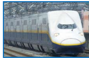
Tohoku & Joetsu Shinkansen "Max"

Tohoku Shinkansen (631.9 km) Train Names: HAYATE, YAMABIKO, NASUNO, Max-YAMABIKO, Max-NASUNO