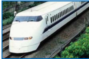
Tokaido & Sanyo Shinkansen "HIKARI"