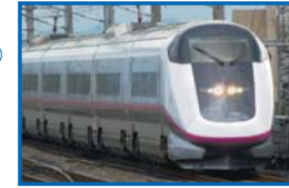
Akita Shinkansen "KOMACHI"

Yamagata Shinkansen (421.4 km) Train Name: TSUBASA