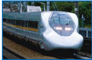
Sanyo Shinkansen "HIKARI Rail Star"

Sanyo Shinkansen (622.3 km) Train Names: NOZOMI, HIKARI (incl. HIKARI Rail Star), KODAMA (Tokyo thru Hakata, 1,174.9 km)