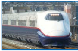
Nagano Shinkansen "ASAMA"

Akita Shinkansen (662.6 km) Train Name: KOMACHI