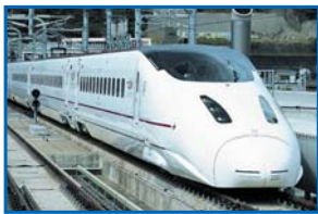
Kyushu Shinkansen "TSUBAME"

Note: There are three types of train services, "NOZOMI," "HIKARI" and "KODAMA" on the Tokaido and Sanyo Shinkansen, and the stations at which trains stop vary by train types. The JAPAN RAIL PASS is only valid for "HIKARI" and "KODAMA" trains, and not valid for any seats, reserved or non-reserved, on "NOZOMI" trains. To travel on the Tokaido and Sanyo Shinkansen, the pass holders must take "HIKARI" or "KODAMA" trains, or pay the basic fare and the Shinkansen express charge to take "NOZOMI" trains. (See p. 5 for detail)