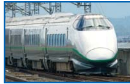
Yamagata Shinkansen "TSUBASA"

Yamagata Shinkansen (421.4 km) Train Name: TSUBASA